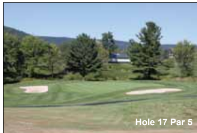
Hole 17 Par 5

Familiar faces still abound at Carroll Valley at Liberty Mountain. And still more changes will come. The exposed wood and stone architecture that we spoke of will be the tone for the future renovation of existing resort buildings. This year the pedestrian Plaza Circle will be created to serve as a multi-season village center where you'll find everything from wedding ceremonies to ice skating taking place. Liberty Mountain has also acquired the Fairway Springs historic home that is so recognizable at the resort's entrance. Plans call for this 1840 stone manor house to be fully renovated and ready for use by 2017. “Stay and Play” golf packages with excellent seasonal specials are featured at the Carroll Valley Golf Course at Liberty Mountain Resort and with the wonderful upgrades, expect this admired retreat near the Mason-Dixon Line to be as popular as ever. 🍷