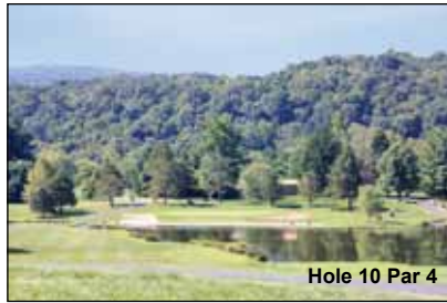
Hole 10 Par 4

That same lake from the previous hole plays a major role on the back nine opener at Carroll Valley. This par 4 evokes fear on your tee ball because shots missed to the right end up wet. Keep those sweaty palms dry because you must cross the lake to get to the putting surface. The par 5 twelfth stretches straight downhill in splendor where a solid drive can lead to a “go for it” decision from the fairway. Buyer Beware! That menacing creek must be crossed again just short of the green. Several hard hitting par 4s make up the meat of the back nine, most notably the sixteenth that is rated the toughest hole on this side. Seventeen is the final of the 5 pars, and it is only fitting that eighteen is a par 3. This good hole plays to a green nestled next to some of the lodging. Don't be surprised if you hear some chirping from the balconies as you line up that last birdie putt.