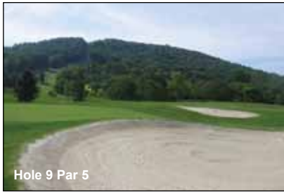
Hole 9 Par 5