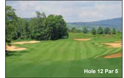
Hole 12 Par 5

Musket Ridge's clubhouse and banquet hall are unapparelled at daily fee golf courses in the mid-Atlantic. Both structures are situated on a bluff overlooking the course and the Middletown Valley. The Catoclin Hall at Musket Ridge has been hailed as "Best Wedding Vendor" by Washington Bride and Groom as well as receiving a WeddingWire Couples' Choice Award .