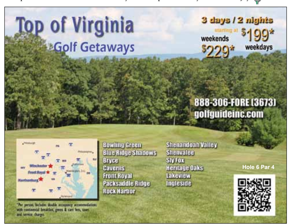
For more information visit slyfoxgolf.com

My late father, who was an incredibly brilliant man, would ask me "Does it pass the parking lot test?" The new Sly Fox passes that experiment in my eyes. I see more patrons each time I visit and a vastly enriched product that you too will enjoy.