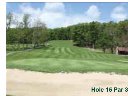
Hole 15 Par 3