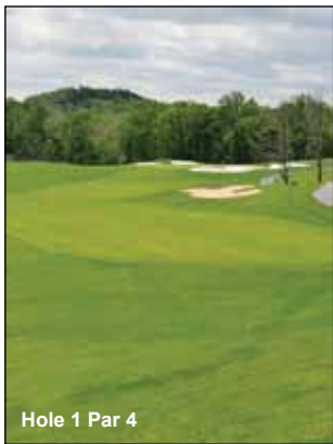
Hole 1 Par 4

Few public courses, if any in the mid-Atlantic, combine challenge and beauty as effortlessly as the Robert Trent Jones Sr. design at Cacapon Resort State Park. Located at the base of Cacapon mountain in Berkeley Springs at an elevation of 2,300 feet, West Virginia State Parks presents one of their signature resorts with an outstanding golf course and accompanying 6,000-acre state park. They also oversee and operate golf resorts at Canaan Valley in Davis, Twin Falls in Mullens, Pipestem in Pipestem, and Stonewall in Roanoke.