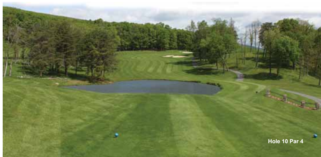
Hole 10 Par 4