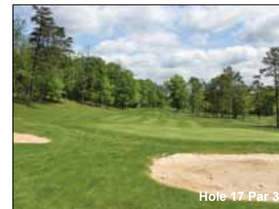
Hole 17 Par 3