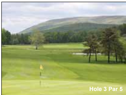
Hole 3 Par 5

The outward nine at Cacapon Resort opens with a dogleg right par 4. Since you play from an elevated tee shot to an uphill approach, I recommend taking an extra club here. While Cacapon has only a couple of water hazards to contend with, one stretches down the right side of the par 4 second hole. The par 5 third, usually a three shot hole, poses most of your trouble down the right side. Holes