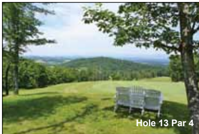
Hole 13 Par 4

This breathtaking mountain course begins with a short drive off of Interstate 81. As you wind your way up the mountain, expect to see a cow or two and you might even run into a goat. Yes, a local might say, you'll find Packsaddle Ridge "just up yonder." You will discover total tranquility at this facility with its mile-long driveway bordered by white three-bar fencing. While Packsaddle Ridge can boast having many signature-worthy holes, two on the back nine stand out head and shoulders above the rest. The par 4 thirteenth, simply called "The View," doesn't host a panel full of ladies bickering back and forth about Hollywood gossip! This hole plays just over 300 yards and runs uphill all the way. You can really absorb the natural view of the valley below with glimpses of Harrisonburg and the campus of JMU on the horizon from a bench sitting area behind the green. On a clear day, even the bordering state of West Virginia comes into view. The par 3 fifteenth, appropriately named "The Packsaddle," also merits attention. A long cart ride escorts you to a tee box perched on the side of a cliff. A thrilling downhill tee ball will hang in the air for what seems like an eternity before hopefully landing on the sloping green fronted by a large pond.